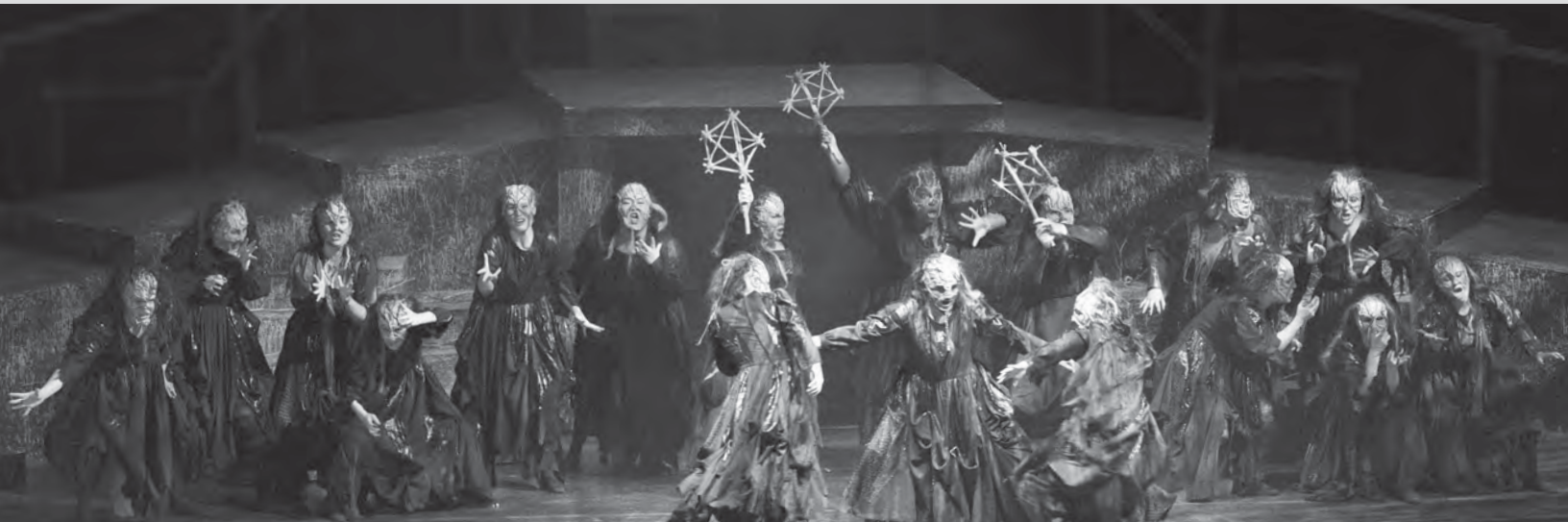
Macbeth, 2015

Pine Valley High School; Chautauqua Regional Youth Ballet; Ray Evans Theater (Salamanca, NY); Chautauqua Opera Debut.