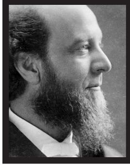
Bishop John Heyl Vincent

“Education, once the peculiar privilege of the few, must in our best earthly estate become the valued possession of the many.”