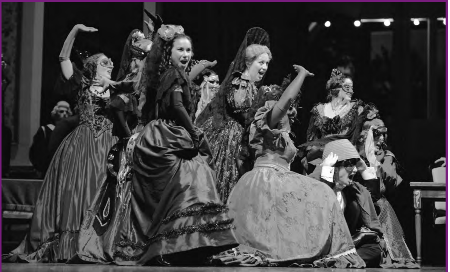
Verdi - La Traviata 2016