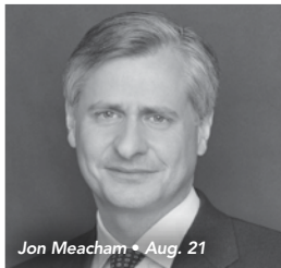
Jon Meacham • Aug. 21

The Future We Want, The World We Need: Collective Action for Tomorrow's Challenges