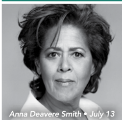
Anna Deavere Smith • July 13